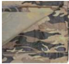
Green Camouflage Brown Camouflage